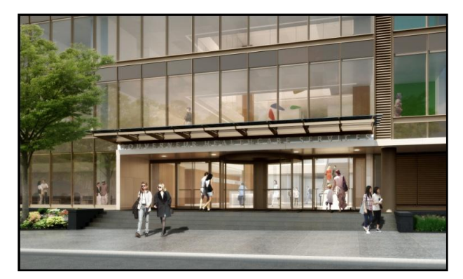
Rendering 2: New Main Entrance

The Gouverneur Healthcare Services building will not be constructed as a LEED project. Design consultants implemented the use of lighting motion sensors as replacement to manual switches for a majority of areas throughout the building. Additionally, as required by code, mechanical infrastructure upgrades will feature energy efficient systems. An alternate to the design, which is to be decided at a later time, is to feature a green roof garden for the use of patients of the hospital on the 6^{th} floor roof.